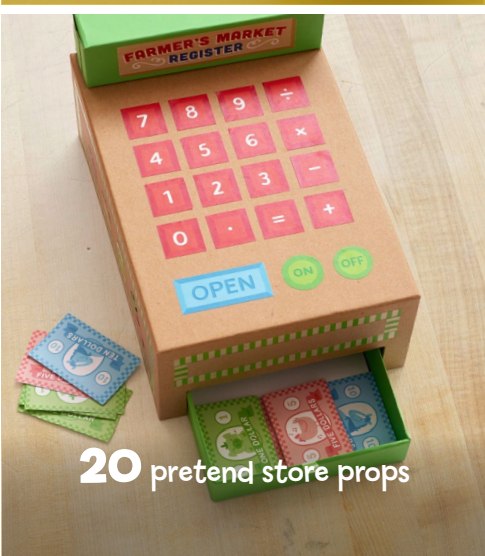
20 pretend store props