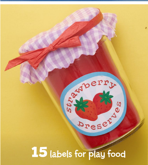
15 labels for play food