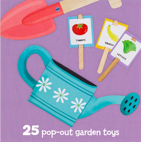
25 pop-out garden toys