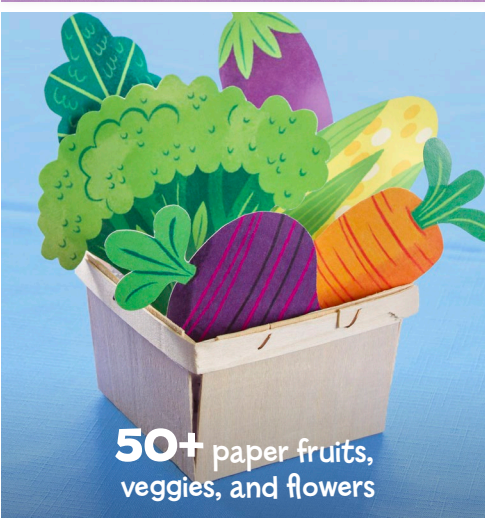
50+ paper fruits, veggies, and flowers